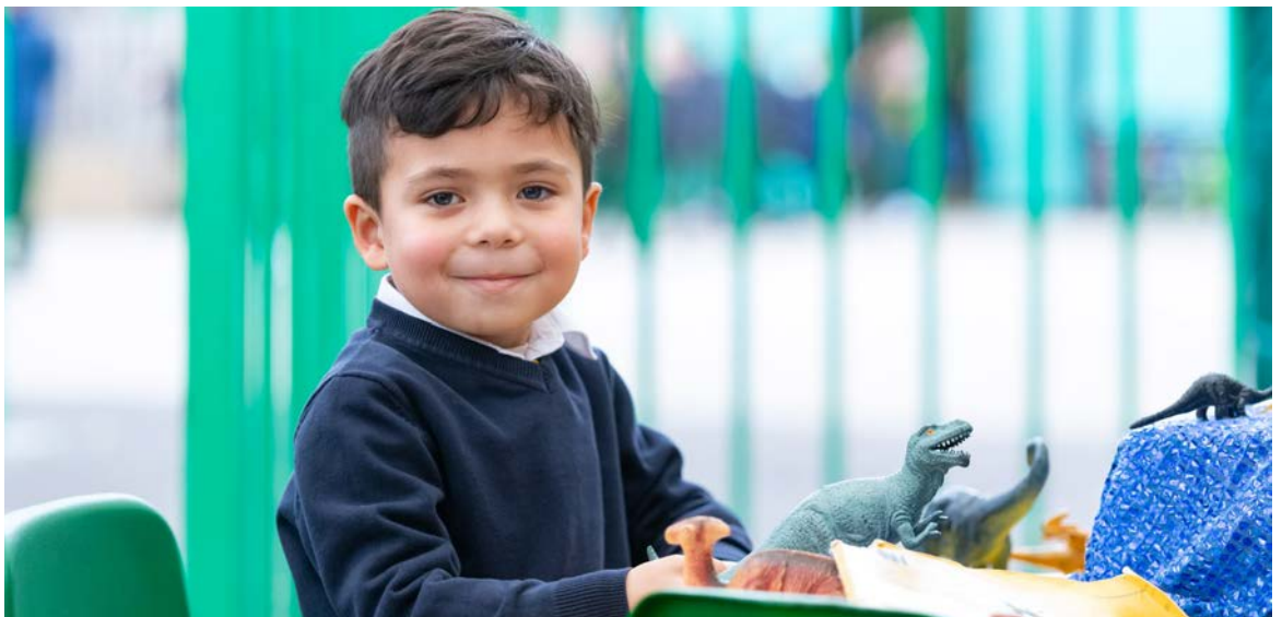
Learning through play Reception