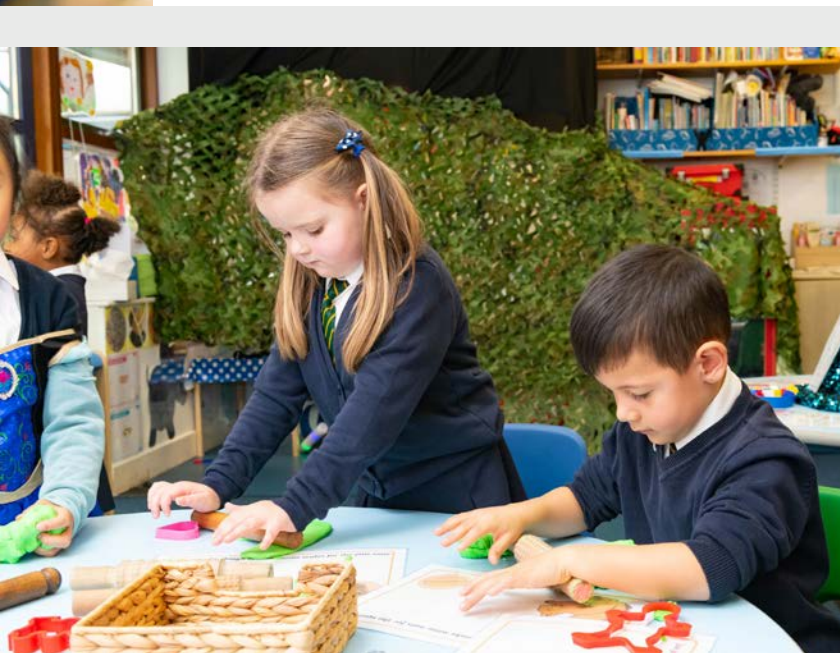
Development of motor skills Reception