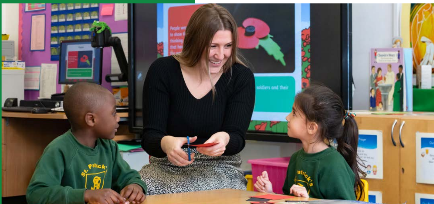
Year 1 Poppy Appeal Project