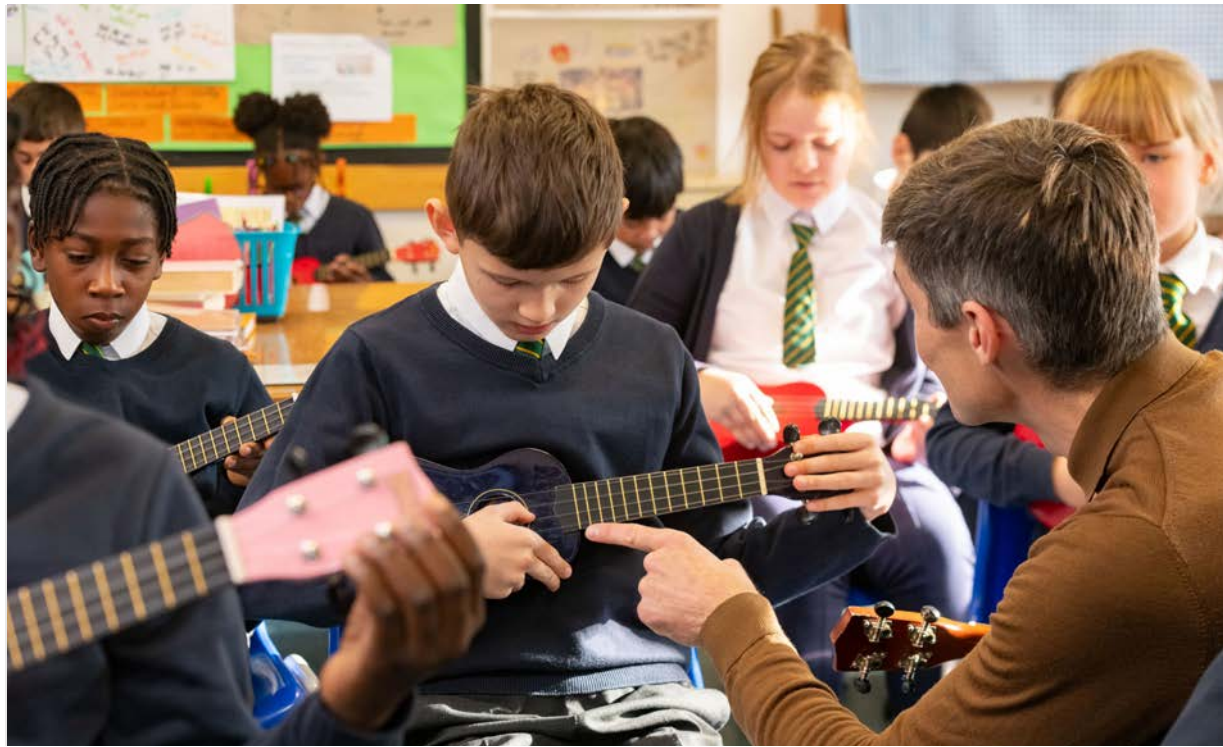
Year 5 Ukulele Lesson Afterschool Clubs Karate and Ballet